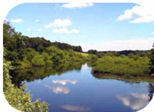
Courts have upheld strong resource protection regulations like these wetland and water regulations in Massachusetts

A. To meet due process and other constitutional requirements, the regulatory standards applied to wetlands must have a reasonable connection (nexus) to regulatory goals. Courts have, with very few exceptions, upheld resource protection regulations against challenges that they lack a reasonable nexus. See, for example, in Hallco Texas, Inc. v. McMullen County , 934 F.Supp. 238 (S.D.Tex. 1996) the court upheld regulations for solid waste disposal within three miles of lake as fairly debatable. See also City of Austin v. Quick , 930 S.W.2d 678 (Tex. App. 1996) in which the court upheld a city ordinance that regulated the amount of contaminants in runoff and the amount of impervious surface in a watershed area as not violating due process or equal protection.