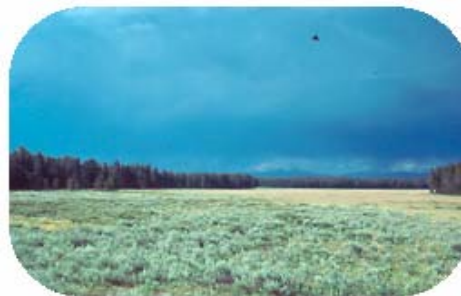
Areas often dry may, nonetheless, be wetlands

A. Legislators and agencies have included wetland definitions in statutes, administrative regulations, and ordinances at all levels of government. These wetland definitions typically contain broad criteria for identification of wetlands on the ground (e.g., saturation, soils, and plants). Federal, state, and local government agencies administering these regulations have often adopted more specific criteria utilizing more specific combinations of hydrology, vegetation, and soils. These criteria are then applied through air photo interpretation and other sources of information to prepare wetland maps. The criteria are also applied in onsite field investigations (“delineation”) to determine precise wetland boundaries.