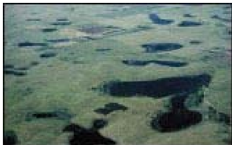
Prairie pothole region in North Dakota.