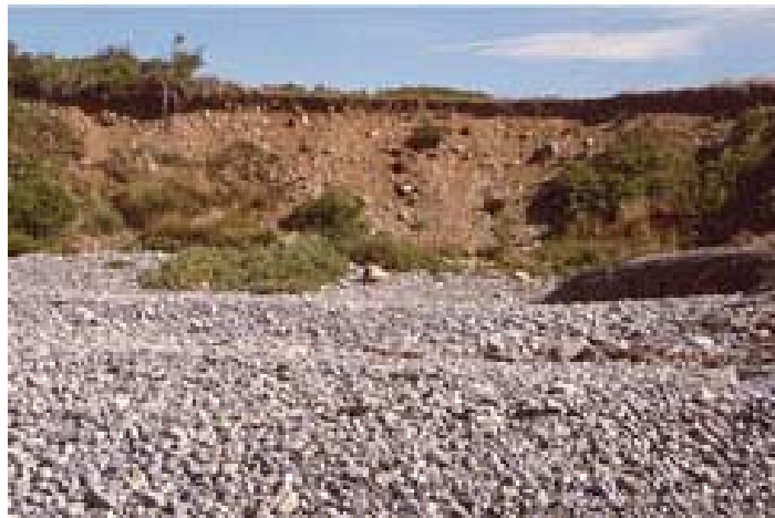
Bluff erosion and gravel beach formation at Fletcher Neck in Biddeford.

http://www.maine.gov/spo/mcp/downloads/beaches%20future/Protecting%20Maines%20Beaches_Feb06.pdf .