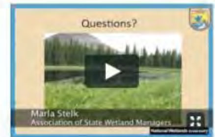
Part 4: Questions