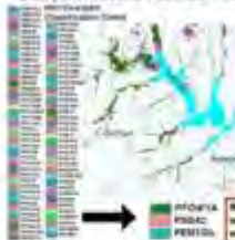
Example of National Wetland Inventory (NWI) Map

The site also provides information about the activities of the Wetland Mapping Consortium including future and past recorded webinars; Coastal Mapping Resources; a summary of the status of state wetland mapping; federal and state wetland delineation manuals; numerous wetland publications; and federal agency wetland websites.