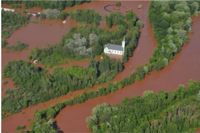
Flood waters surround the Bad River reservation in 2016 after a storm dumped as much as 10 inches of rain in a single night.